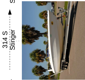
314 S Stinger