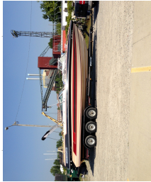
312 SL Stinger