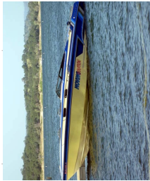
312 SL Scorpion