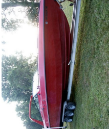
312 SL Stinger Limited